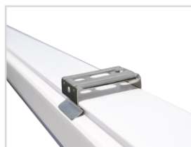
Stainless-steel surface mounting kit, included with the luminaire