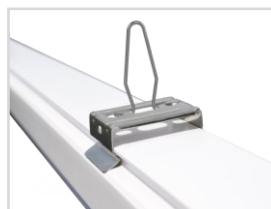
Stainless-steel rope mounting kit, ordered separately; SKU - BL-SRKIT